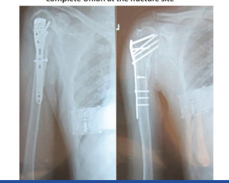
[Table/Fig-15]: Serial radiographs of patient with proximal humerus fracture managed y open reduction and internal fixation by locking compression plate (Group A).

Follow-up X-ray at 9 months showing complete Union at the fracture site