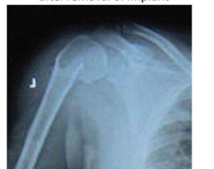
[Table/Fig-17]: Serial radiographs of patient with proximal humerus fracture managed by close reduction and internal fixation by K-wire (Group C).

was 74 (range 71-77). Jaura GS et al., compared plating with locking compression plate (Group 1) with K-wire fixation (Group 2) in proximal humerus in 60 patients. They reported mean constant score of 84.6 in Group 1 and 76.4 (range: 56-100) in Group 2 at final follow-up. They found satisfactory results in both the groups, with each procedure having its advantages and shortcomings [15]. Similarly, in the current study, average constant score in the locking plate group (74.00±2.76) was comparable to K-wire fixation group (70.50±3.20). Gupta AK et al., reported mean constant score of 78.1 in 16 patients treated with Joshi external stabilisation system and that external fixation with JESS was an excellent modality of treatment for Neer's two- and three-part fractures [8]. The present study also supports the above mentioned study with a mean constant score of 72.3.